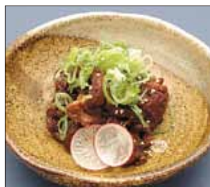
焼肉屋さんの牛筋煮込み Stewed Beef 5.50