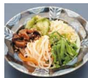
自家製 ナムル Original Namuru 5.80 Assorted marinated vegetable.