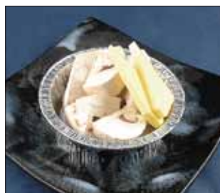
マッシュルームのバター醤油焼き Mushroom with Butter & Soy Sauce 5.90