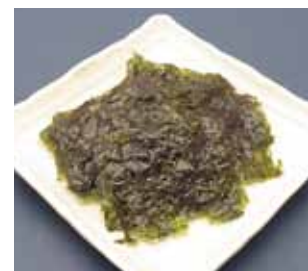
韓国のり Dried Seaweed Sheets 3.30