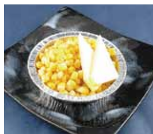
コーンのバター醤油焼き Corn with Butter & Soy Sauce 5.90