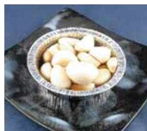
にんにくのごま油焼き Garlic with Sesame Oil 5.90