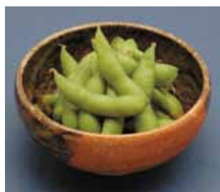
えだまめ Edamame 4.00