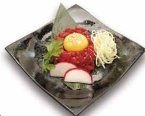
ユッケ Yukke 8.90 Beef tartar with egg yolk, mix well and eat raw.