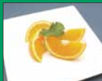
45. Today's Fruits