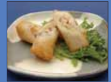
29. Spring Roll