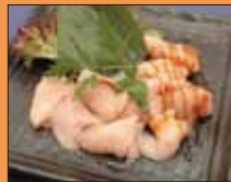
06. Chicken Breast