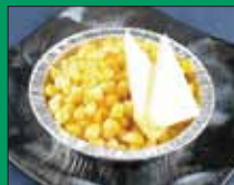
43. Corn w Butter