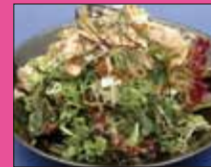
20. Seaweed Salad