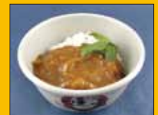
49. Vegetarian Curry