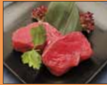
03. Beef Eye Fillet