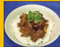
51. Stewed Beef Rice Bowl