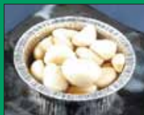
44. Garlic w Sesame Oil