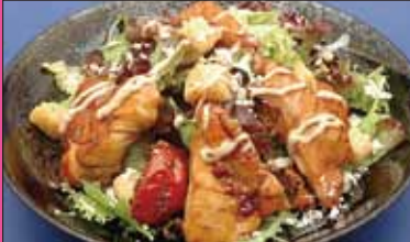
22 Teriyaki Chicken Caesar Salad

Gourmet Buffet + additional menu as follows, PLUS