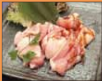
05. Chicken Thigh