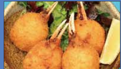
35. Crab Claw