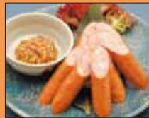
08. Pork Sausage