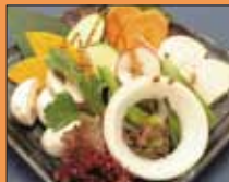
15. Seasonal Vegetable