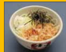
53. "Negi" Rice