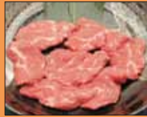
02. Beef Loin