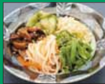
41. Original Namuru