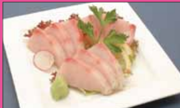
26. King Fish Sashimi