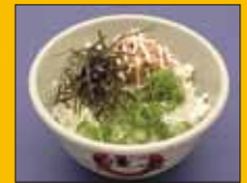
52. Tuna & Mayo Rice