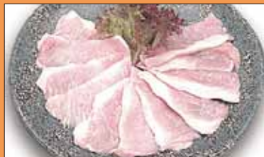
17. Pork Jowl