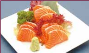
25. Salmon Sashimi