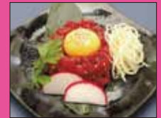
21. Yukke (raw beef tartar)