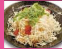
18. Fluffy Cabbage Salad