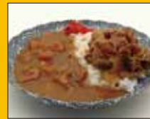
50. Japanese Beef Curry