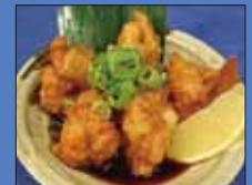
32. Ponzu Kara-age