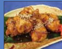
31. Teriyaki Kara-age