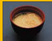
47. Miso Soup