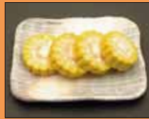
12. Corn on the cob