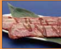
04. L.A Short Rib