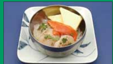
46. Scallop w Butter