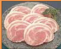
07. Pork Belly