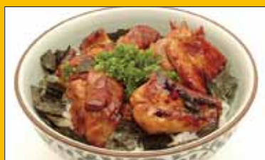
56. Teriyaki Chicken Rice Bowl