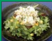
38. Potato Salad