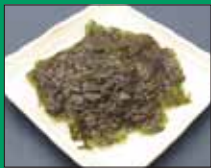
39. Dried Seaweed Sheets