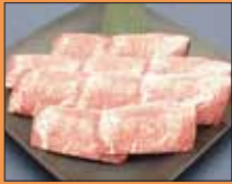
01. OX Tongue

Adult $39.90 Child (6~11 yrs) $17.90 *Free for under 5yrs