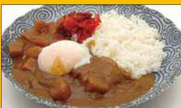
55. Ontama Curry