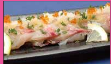
27. King Fish Carpaccio