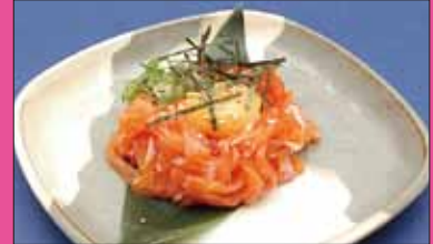
24. Salmon Yukke