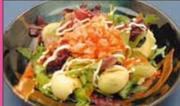
23. Salmon &amp; Avocado Salad