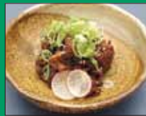
40. Stewed Beef