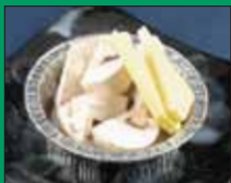
42. Mushroom w Butter