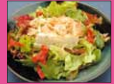
19. Tofu Salad