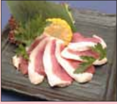
上合鴨 Duck 13.5 Salt or BBQ sauce.

Choice of Salt : marinated Salt & Pepper BBQ : marinated BBQ sauce