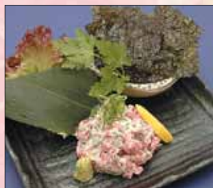
牛ねぎとろ巻 Finger Roll Beef Sashimi Raw beef marinated with mayo & shallot. Roll it up with dried seaweed.