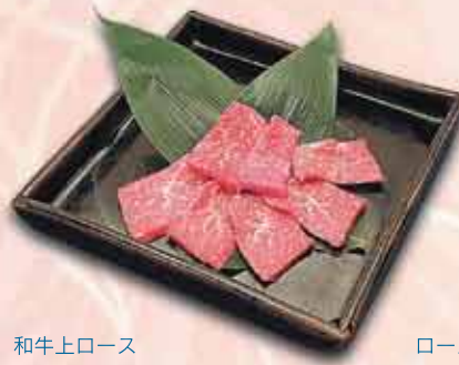
和牛上ロース "Wagyu" Special Beef Loin 17.9 Please choose : Salt & pepper or BBQ sauce