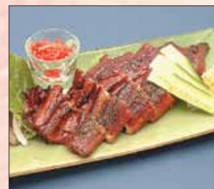
うなぎの蒲焼き Eel with Teriyaki sauce