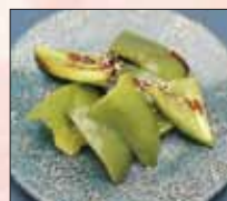
ピーマン Capsicum 3.5