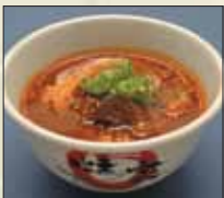
カルビクッパ Beef Rib Porridge 10.9 Rice in spicyhot soup.