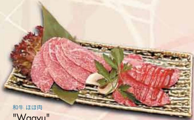
和牛 ほほ肉 "Wagyu" Beef Cheek 11.8 Please choose : Salt & pepper or BBQ sauce