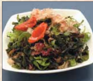
わかめサラダ Seaweed Salad 8.5 (soy dressing)