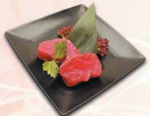
牛フィレ Beef Fillet 16.5 Please choose : Salt & pepper or BBQ sauce