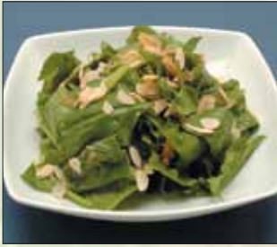
ほうれん草とアーモンドのサラダ Spinach & Almond Salad 8.5 Tuna flake & sliced onions. (soy dressing)