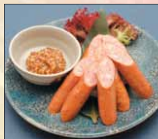
ポークソーセージ Pork Sausage 7.8 Salt or BBQ sauce