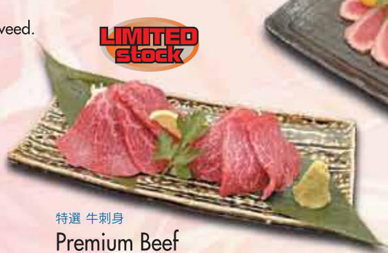
特選 牛刺身 Premium Beef Sashimi (7pieces) 19.9