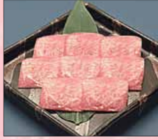
塩上タン Original Sliced OX Tongue 9.9 Served with salt & pepper.