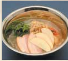
こうや風 冷麺 Koh-ya Original Cold Noodle 9.6 Potato noodles in cold soup.