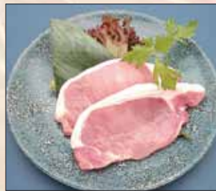
豚ロース Pork Loin 9.9 Salt or BBQ sauce