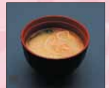
味噌汁 Miso Soup 2.8