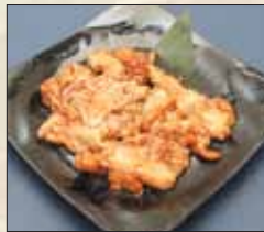
和牛 上ホルモン "Wagyu" Special Beef Intestine 8.9 Please choose : Salt, Miso sauce or Miso chilli sauce