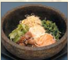
石焼き ビビンバ Stone Pot 10.9 Bibimba (with Soup) Veges, egg, beef mince & dried seaweed on rice.