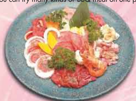
バーベキュープラッター セット BBQ Platter Set 72.0 for 2 people *Extra person 36.0

Ideal choice for Yakiniku with your friends or family. You can try many kinds of BBQ meat on one plate.