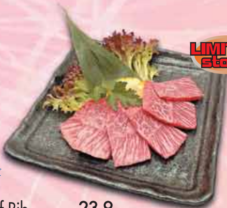
特選 和牛特上カルビ "Wagyu" Premium Beef Rib 23.9 Please choose : Salt & pepper or BBQ sauce