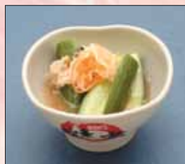
オイキムチ Cucumber Kimchee