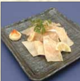
エイひれのあぶり焼き Dried Ray Wings 8.8