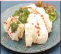
キャベツ Cabbage 3.5