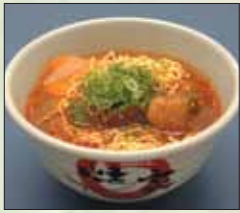
カルビラーメン Beef Rib Noodle Egg noodles 11.6 in hot and spicy soup.