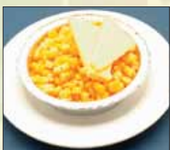
コーンのバター焼き Corn with Butter 4.5