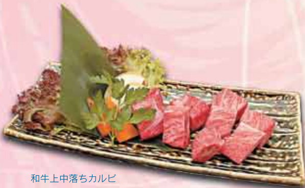
和牛上中落ちカルビ "Wagyu" Special Beef Rib Finger 16.5 Please choose : Salt & pepper or BBQ sauce