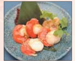
ホタテ Scallop 10.9 (5pieces)