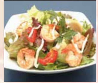
海老のカクテルサラ Prawn & Avocado Salad 9.9 (wasabi mayonnaise dressing)