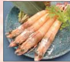
有頭えび Prawn 11.9