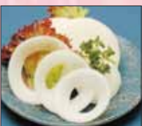
玉ねぎ Onions 3.5