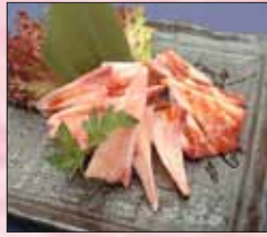
鶏のなんこつ Chicken 6.9 Soft Bone Salt or BBQ sauce.