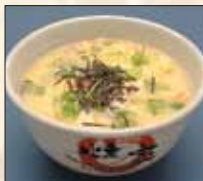
たまごクッパ Egg Porridge 7.0