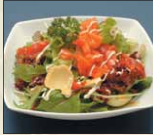
サーモンとアボカドのサラダ Salmon & Avocado Salad 9.9 (french dressing & mayonnaise)