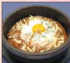
石焼き チーズカレー Stone Pot 12.9 Cheese Curry