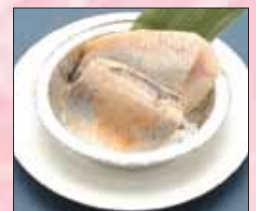
白身魚のバター焼き Fish with Butter 5.0