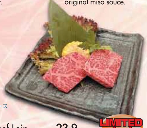
特選 和牛特上ロース "Wagyu" Premium Beef Loin 23.9 Please choose : Salt & pepper or BBQ sauce