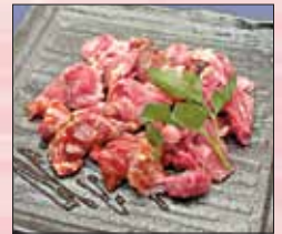
牛タンもと Under Tongue 7.8 Please choose : Salt or BBQ sauce