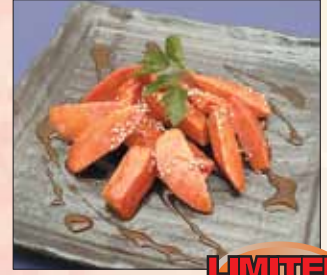
味噌牛タン Original Miso OX Tongue 10.5 Marinated with original miso sauce.