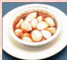
にんにくのごま油焼き Garlic in Sesame Oil 4.5