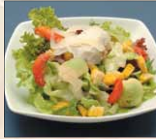
アボカド&ミックスグリーンサラダ Avocado & Mix Green Salad 8.8 (french dressing)