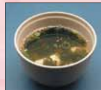
わかめスープ Seaweed Soup 2.8