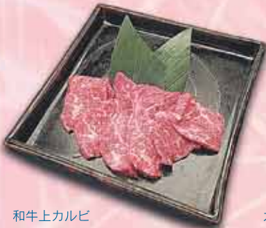
和牛上カルビ "Wagyu" Special Beef Rib 17.9 Please choose : Salt & pepper or BBQ sauce