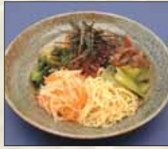
ビビン麺 Bibim Noodle Egg noodles 11.6 under marinated veges.