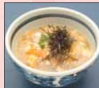
たまごスープ Egg Soup 6.0