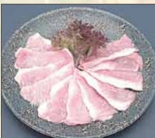
豚トロ Pork Neck 9.9 Salt or BBQ sauce