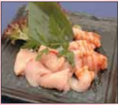
皮なし鶏の胸肉 Chicken 6.9 Breast Salt or BBQ sauce.