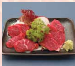
牛刺身 Beef Sashimi (7pieces)