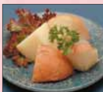
じゃがいも Potato 3.5