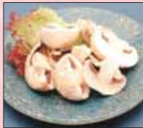
マッシュルーム Mushrooms 3.5