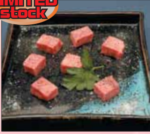
特選 特上サイコロ牛タン Premium Diced OX Tongue 13.8 Juicy and tender.