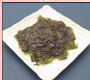
韓国のり Dried Korean Seaweed Sheets