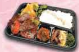
上カルビ弁当 "Wagyu" Beef rib Bento Box 16.8