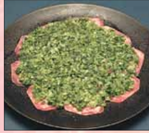
ねぎ塩上タン Special Negi-shio Tongue 11.9 Served with chopped shallots mixed with salt.