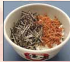
じゃこ ごはん Jako Rice 8.0 Soy flavored S 4.8 small white-bait on rice with dried seaweed.