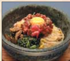
石焼き ユッケビビンバ Stone Pot 12.9 Beef Tartar Bibimba (with Soup) Veges, egg, yukke & dried seaweed on rice.