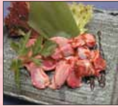
鶏の砂肝 Chicken 6.9 Giblet Salt or BBQ sauce.