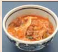
カルビスープ Beef Rib Soup 9.9