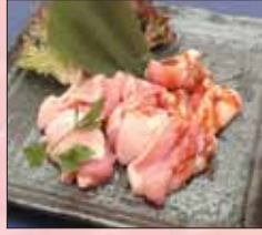
皮付き鶏のもも肉 Chicken 6.9 Thigh with skin Salt or BBQ sauce.