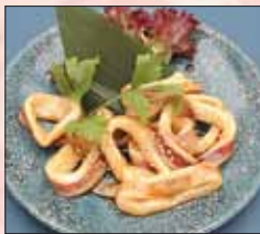
いか Calamari 6.9