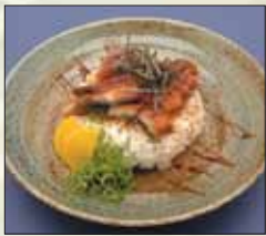
うなぎ ごはん Eel on Rice 12.8