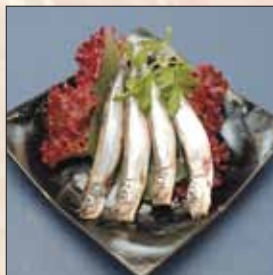
子持ちししゃものあぶり焼き Sardine 6.6