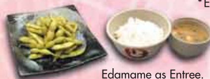
Edamame as Entree.