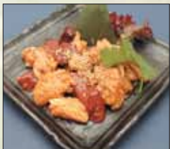
牛ホルモンミックス Assorted Beef Intestine 14.5 Please choose : Salt, Miso sauce or Miso chilli sauce