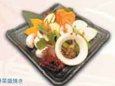
Assorted Seasonal Vegetables 8.8