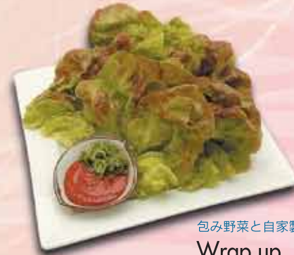
包み野菜と自家製味噌ディップ Wrap up Sunny Lettuce & Miso Dip 5.9