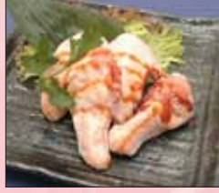
鶏の手羽先 Chicken 6.9 Wings (4pieces) Salt or BBQ sauce.