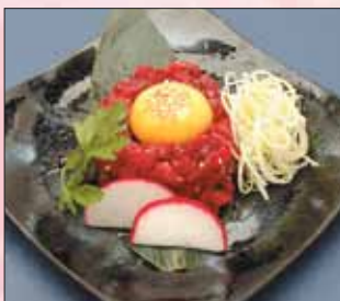
ユッケ Yukke Raw beef tartar with egg york.