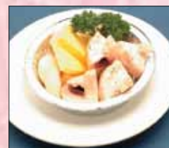
マッシュルームのバター焼き Mushroom with Butter 4.5