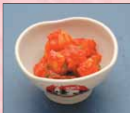
カクテキ Radish Kimchee