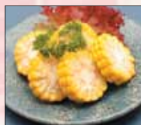
とうもろこし Corn on the cob 3.5