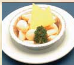
にんにくのバター焼き Garlic with Butter 4.5