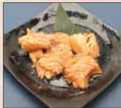
和牛 上ミノ Special Beef Tripe 8.9 Please choose : Salt, Miso sauce or Miso chilli sauce