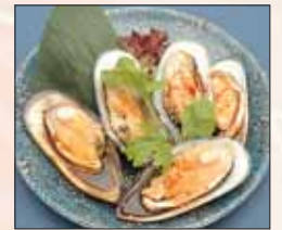
ムール貝 Mussel 6.9 (5pieces)