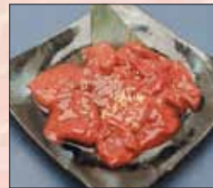
牛レバー Beef Liver 6.5 Please choose : Salt, Miso sauce or Miso chilli sauce