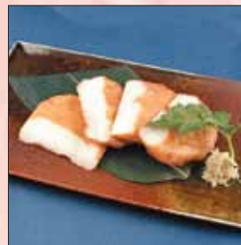
さつま揚げの生姜焼き Satsuma-age (fish Cakes) 5.5