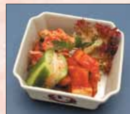
キムチの3種盛り合せ Assorted Kimchee