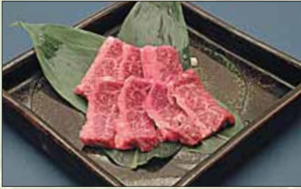
和牛 上ハラミ "Wagyu" Special Beef Harami 16.5 Part of the diaphragm muscle.