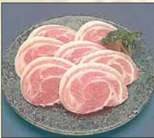
豚カルビ Pork Rib 9.5 Salt or BBQ sauce