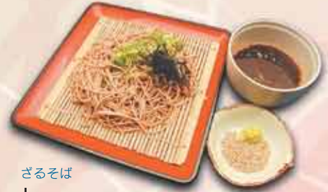
ざるそば Japanese Cold Soba 8.5