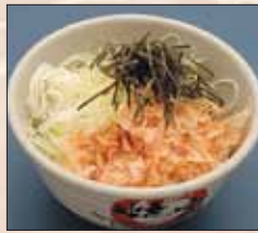
ねぎ ごはん Negi Rice 7.6 Chopped leeks, S 4.5 dried bonito flakes and dried seaweed on rice.