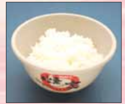
ごはん Rice S 2.2 R 2.8 L 3.5