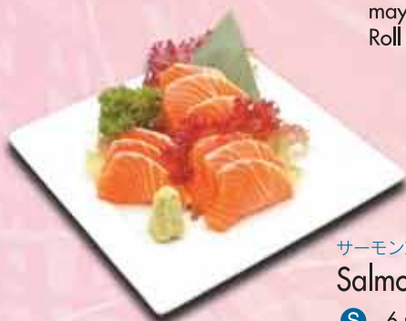
サーモン刺身 Salmon Sashimi S 6 pieces 9.9 L 12 pieces 17.9