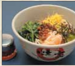
ビビンバ Bibimba (with Soup) 8.8 Marinated veges & cooked beef on rice.