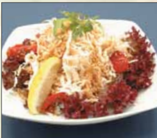
千切りキャベツのサラダ Fluffy Cabbage Salade 6.9 (mayonnaise & BBQ sauce dressing)