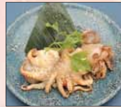
たこ Octopus 6.9