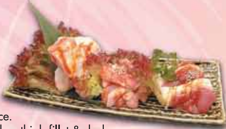
Assorted Poultry 13.9 Served with BBQ sauce. 2 chicken wings, chicken thigh fillet & duck.