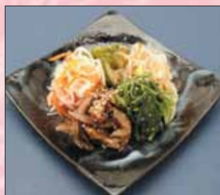
ナムルの盛り合せ Namuru Marinated vegetable.